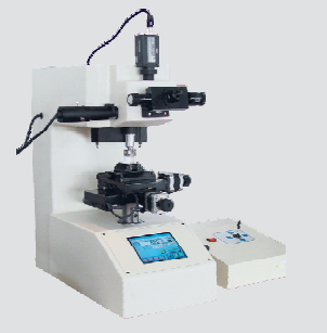
Micro Hardness Tester DM-8