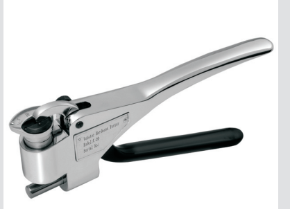
Barcol Hardness Tester