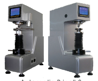
Automatic Brinell & Electric Brinell Hardness Tester