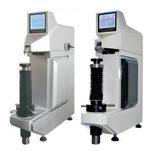
Advance Digital Rockwell Hardness Tester