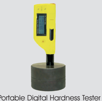
Portable Digital Hardness Tester TH170