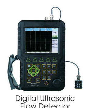
Digital Ultrasonic Flow Detector