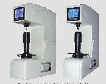
Automatic Rockwell & Automatic Rockwell Superficial Hardness Tester